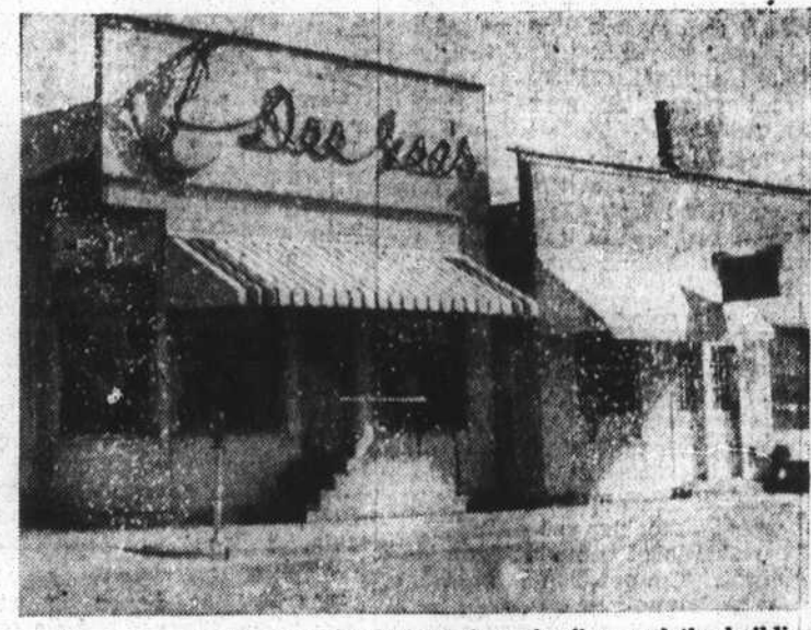
This is Dee Gee's, as it appeared before the fire, and the building next to it, which was occupied by a shoe shop at the time this picture was taken.

"They think we're too rough here when the men from the base get out of line, but we're not," the mayor commented. "We welcome the Marines and have tried our best to cooperate with the base," he concluded.