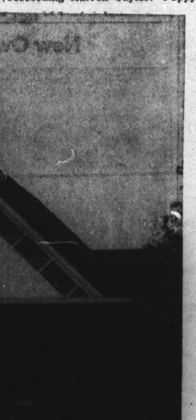
St. James Methodist church, Newport, was dedicated in June.