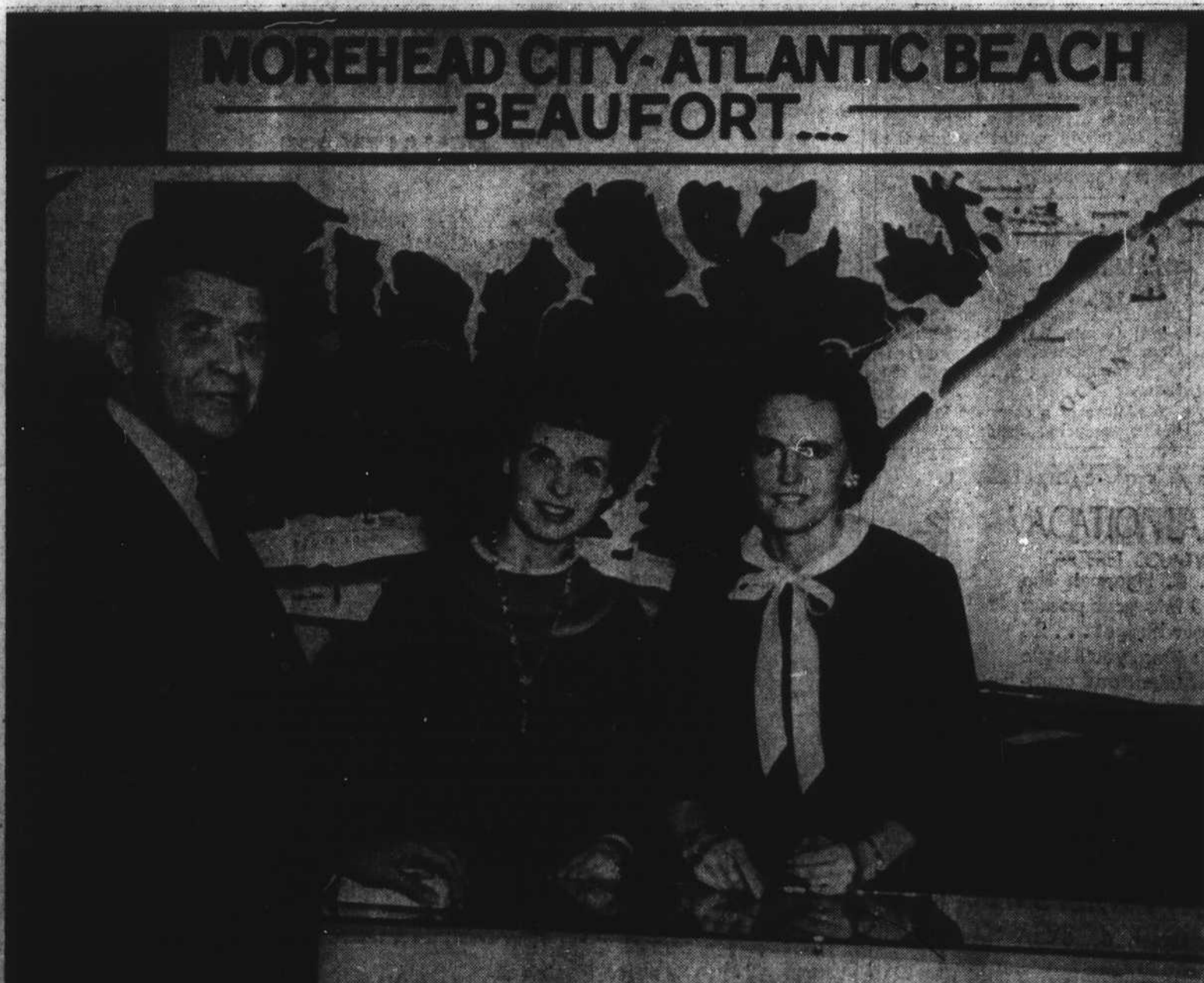
At the Carolina Travel show last week at Charlotte, Gov. Terry Sanford visited the Carteret Vacationland booth. On duty at the time