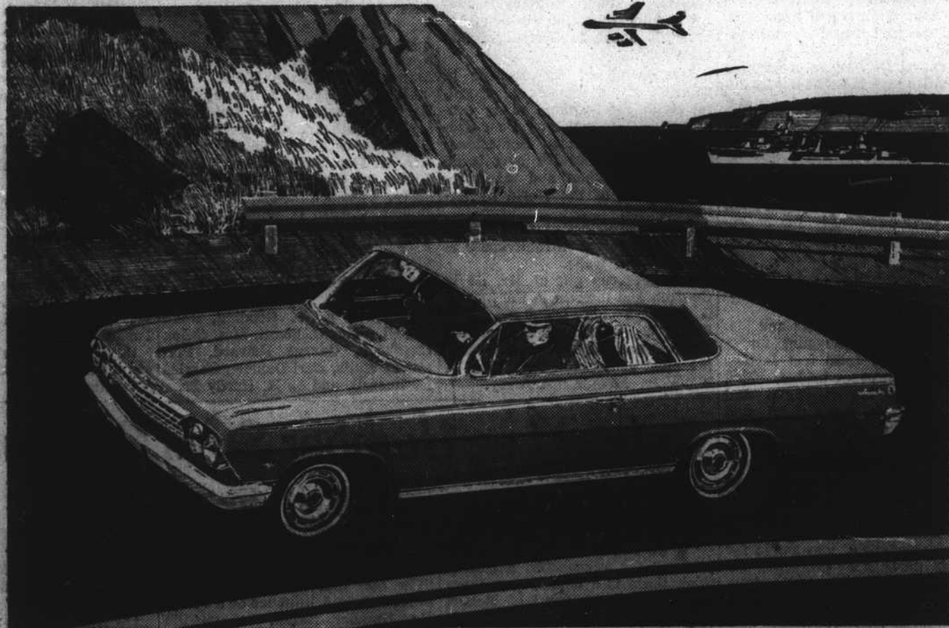
Inspira Sport Coupe—here's about everything you'd expect of an expensive car—except the expense.