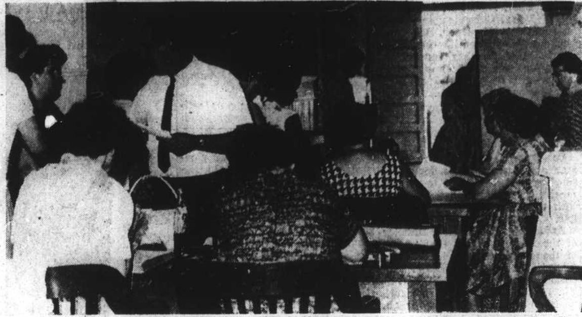
Heavy voting in the second Democratic primary Saturday is shown in this scene taken in the county courthouse at about 10 a.m. Saturday. Voters lined up to get ballots and cast votes for the candidates of their choice. Voting booths are to the right of the corridor and ballot boxes on the opposite side.