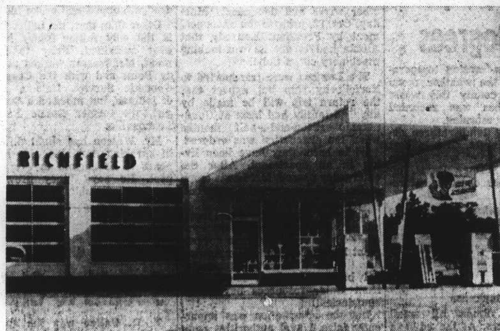
DOWN EAST'S NEWEST, MOST MODERN, SERVICE CENTER.

FREE SET OF FOUR BEAUTIFUL 11-OZ. LIBBY GLASSES* WITH THE PURCHASE OF 8 OR MORE GALLONS OF GASOLINE. (Supply Limited).