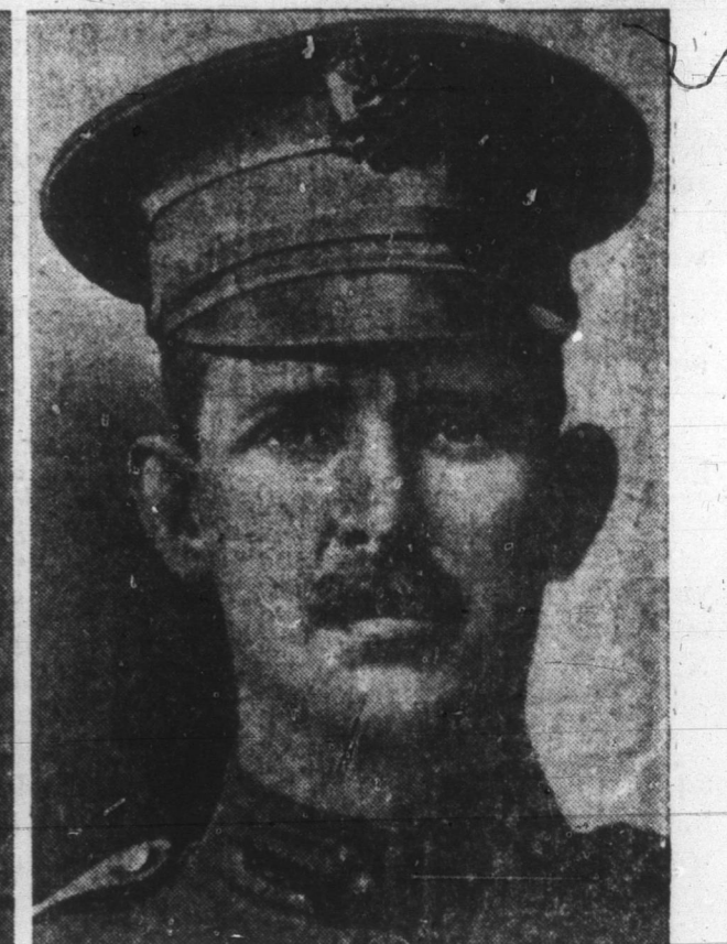
Though Gary Cooper doesn't resemble York externally, there is a great deal of similarity between the two. It was at York's suggestion that Cooper was engaged for the role. Both are quiet, modest and unassuming.