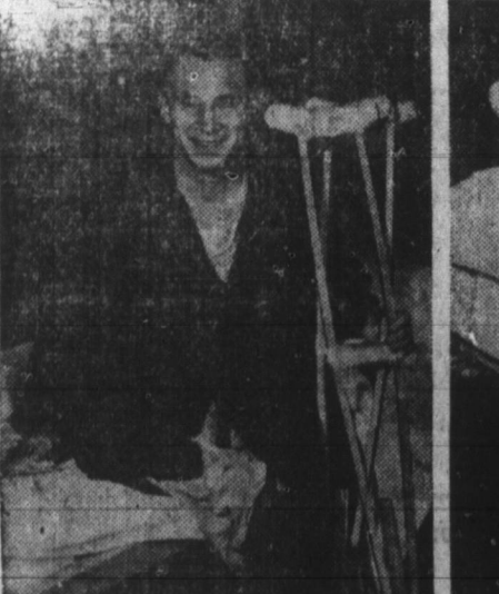
for four years. He was wo during the North African