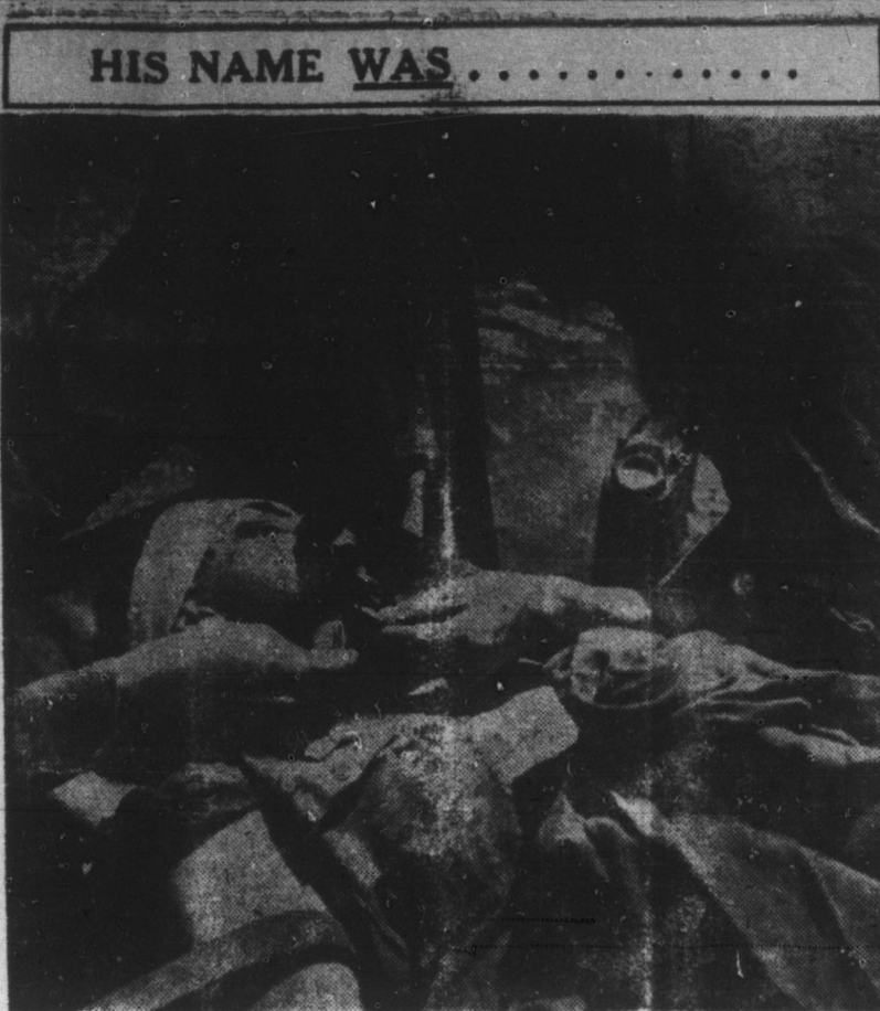
An Army doctor with the Fifth Army in Italy looks at the dog tags of a dead American soldier so that his beloved back home may know that he gave his life for his country. All your country is asking you to do is to give your dollars to back up the men who are fighting for us by buying War Bonds.