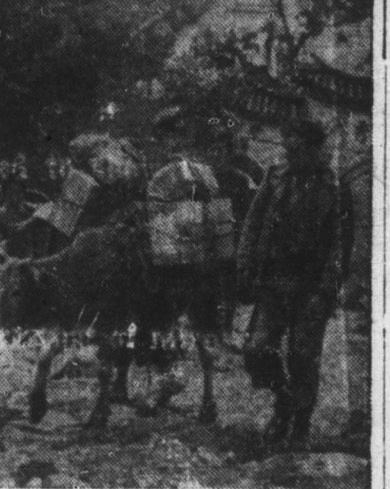
This scene looks peaceful. However, on the back of this ox is laden munitions for our fighting forces on a Pacific island. Your War Bonds are in action everywhere and under strange conditions. You can be sure your War Bonds do a full day's work. Step up your payroll savings. Buy an extra War Bond today. U. S. Treasury Department

• Gall Bladder Sufferers Told to Avoid CONSTIPATION Try Hot Water and Kruschen Salts Before Breakfast for 5 Days