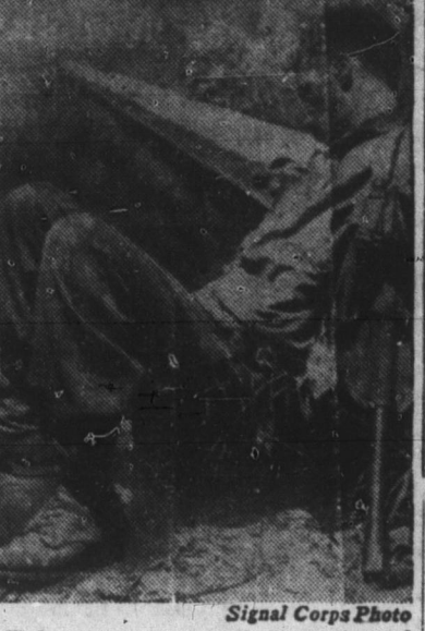
Exhausted from the strain of battle, this soldier of the Fifth Army drops on a roadside in Italy and falls asleep. This man has battle fatigue. You cannot afford to have War Bond buying fatigue. This soldier has done his duty in helping to liberate another town. Have you done your duty in backing him up with War Bonds? Buy an extra Bond today. U. S. Treasury Department