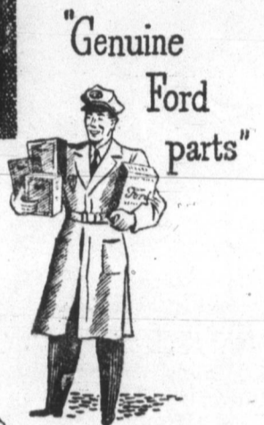
"Genuine Ford parts"

No one else can give your Ford the kind of service it gets from Ford mechanics. We know your Ford better. We know how to repair it better. We have tools that do the job better. And our Genuine Ford Parts are made better, fit better, and work better. Drive in today for a free check-up.