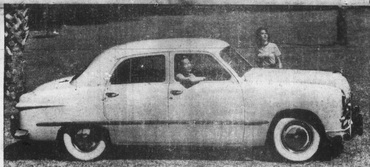
The revolutionary new Ford four-door sedan for 1949 is lower, wider, roomier and provides nearly 25 per cent more visibility.