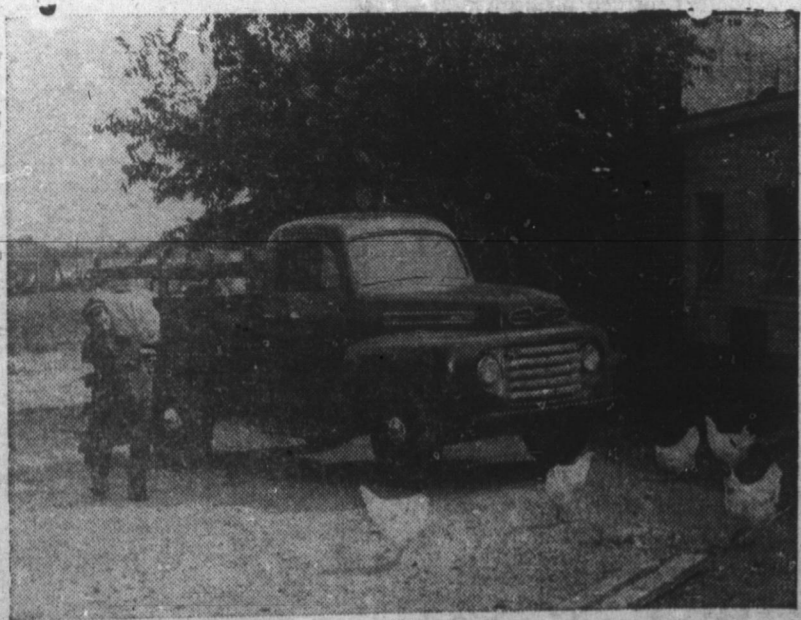
SERIES F-3 1950 model Ford truck with stake body. Maximum gross vehicle weight rating is 6,800 pounds. An eight-foot express body also is provided. One of 175 new 1950 model Ford trucks.