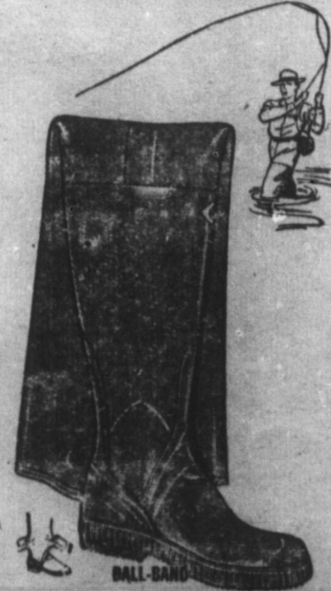
PROFFITT'S STORE BALD CREEK, N. C.