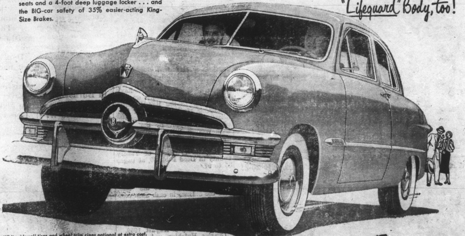
White sidewall tires and wheel trim rings optional at extra cost.

Your choice of V-8 or "Six"! New "Mid Ship" Ride! "Life-guard" Body, too!