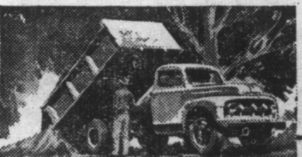
All heavy duty F-5 and F-6 Fords for '51, like this Dump, give you easier, quieter shifting with new, 4-Speed Synchronizer transmission, optional at extra cost.

And only Ford gives you a power choice of V-8 or Six... four great engines! Over 180 models. Come in... Get ALL the facts. Select the new Ford Truck that's right for YOU!