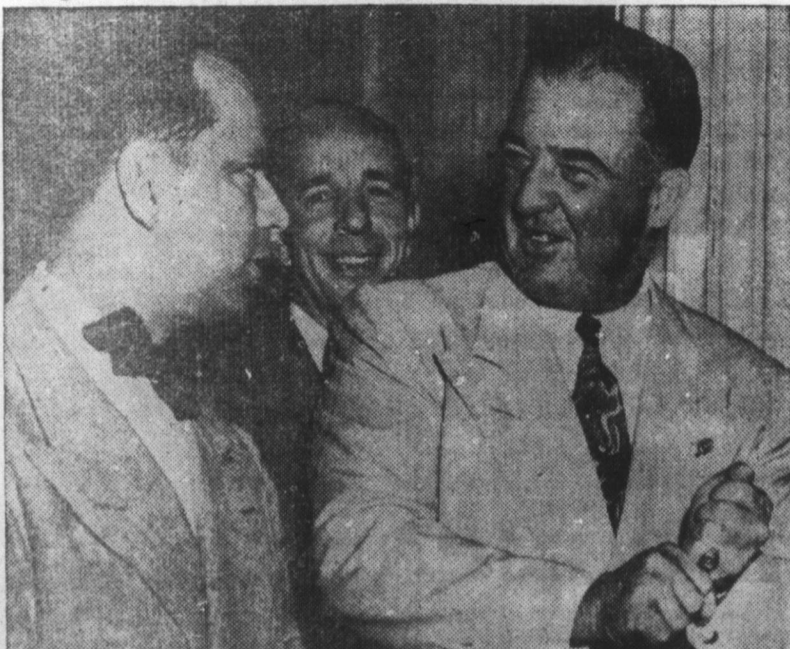
ST. PETERSBURG, FLA. — Baseball Commissioner A. B. "Happy" Chandler told newsmen that he had been informed the Major Leagues had voted against renewing his 7-year contract when it expires on May 1, 1952. In this photo, Chandler is shown in a typical baseball pose while talking to newsmen a few months ago.