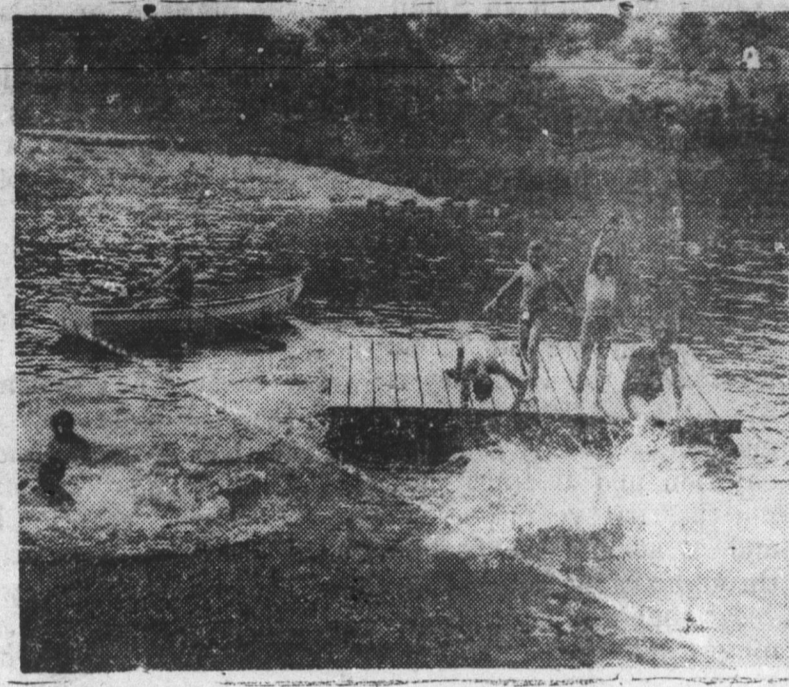
The above photograph shows Boy Scouts enjoying themselves on the lake at Camp Daniel Boone. Two years ago a flood damaged the lake so badly that it needs major repairs. The lake is the heart of the Scout Camp, the thing Scouts want most. Money received from the Adult membership drive this week will go into the repair of this lake as well as to aid in the financing of other phases of work carried on by the Daniel Boone Council.