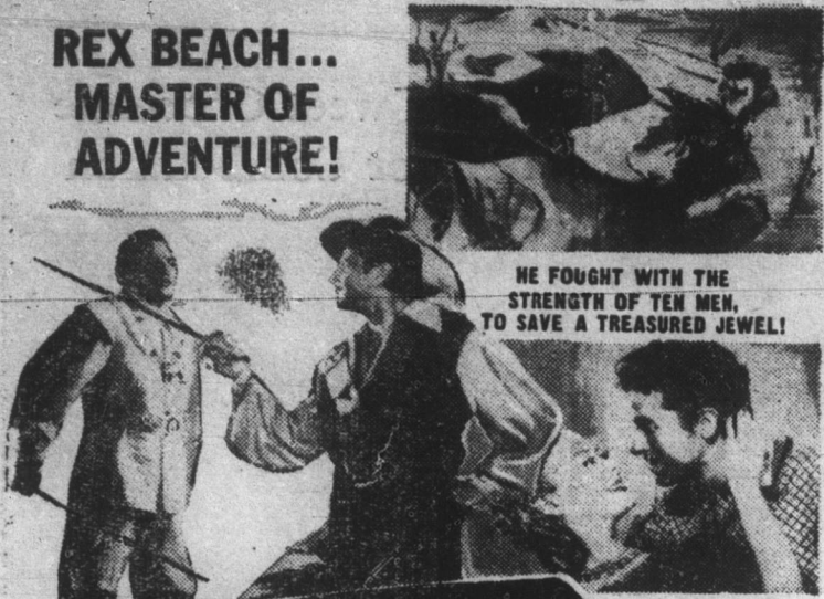
HE FOUGHT WITH THE STRENGTH OF TEN MEN, TO SAVE A TREASURED JEWEL!