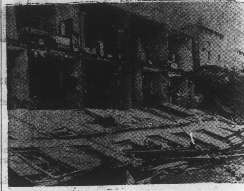
Richmond, Va.—This picture shows several rooms of an apartment building which were exposed to the spring air (June 13) when the front of the house was ripped down by a tornado which struck Richmond, injuring 50 persons.