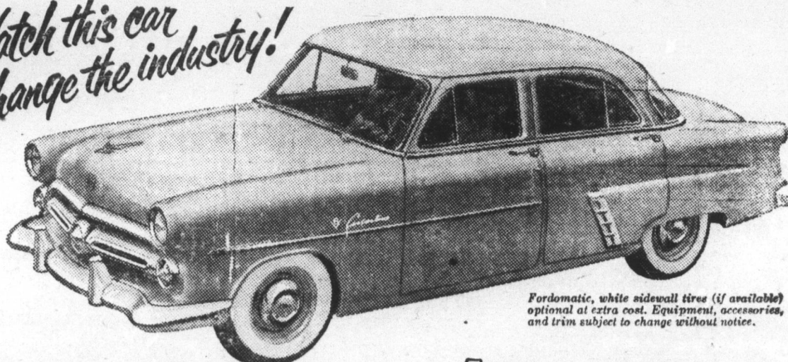
Fordomatic, white sidewall tires (if available) optional at extra cost. Equipment, accessories, and trim subject to change without notice.