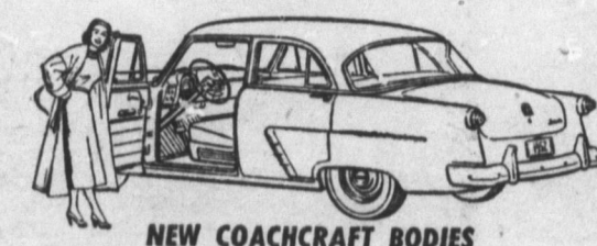
NEW COACHCRAFT BODIES

Here is a car that is truly the ablest car on the American Road... a car that meets the widest range of motorists' needs. Examine it carefully. "Test Drive" it. You'll agree you can't buy better!