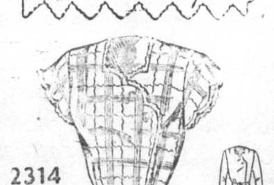
2314 SIZES 12-42