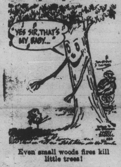
Even small woods fires kill little trees!