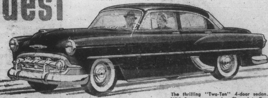
The thrilling "Two-Ten" 4-door sedan. With 3 great new series, Chevrolet offers the widest choice of models in its field.