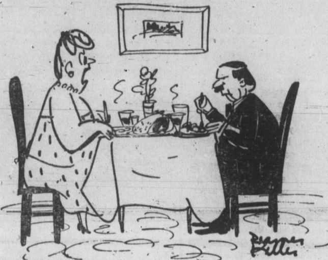
"Watch your step, or I'll learn stenography and become your office wife also!"

Married men don't live longer than single men, it just seems longer.