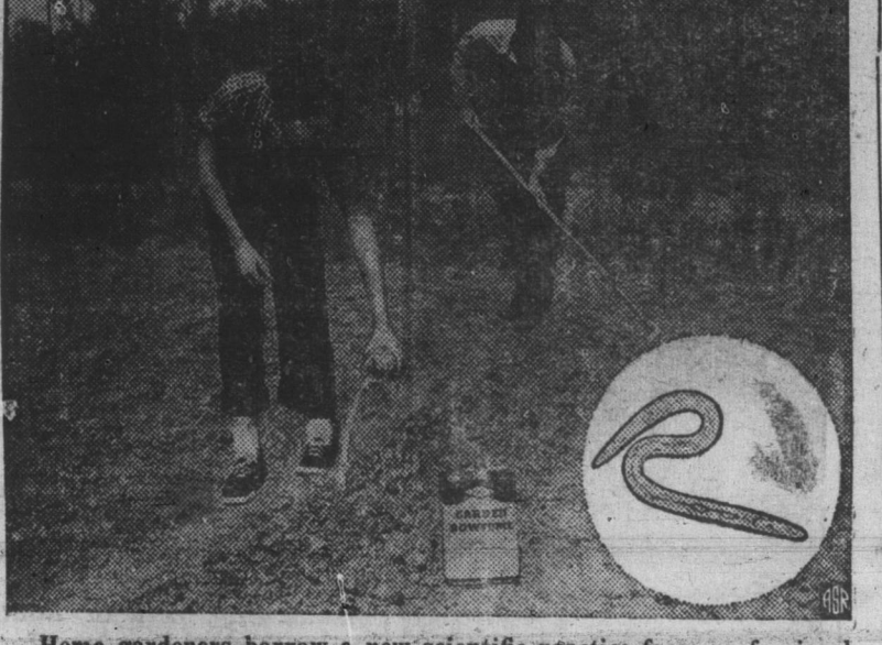
Home gardeners borrow a new scientific practice from professional growers. Vaporizing chemical covered in the soil two weeks before garden is planted kills nematodes and soil insects; often greatly improves crops. Inset: microscope photograph of nematode, eel-like worm which does great damage in gardens and fields.

Home gardeners are learning to recognize damage to plants caused by microscopic soil worms, called nematodes. Root crops such as carrots, beets, turnips, produce poorly and may be short, bushy, crooked, or forked. Cucumber and melon vines show injury by wilting in summer weather but reviving overnight, and yielding poorly. Tomato vines fail to develop well and bear few tomatoes.