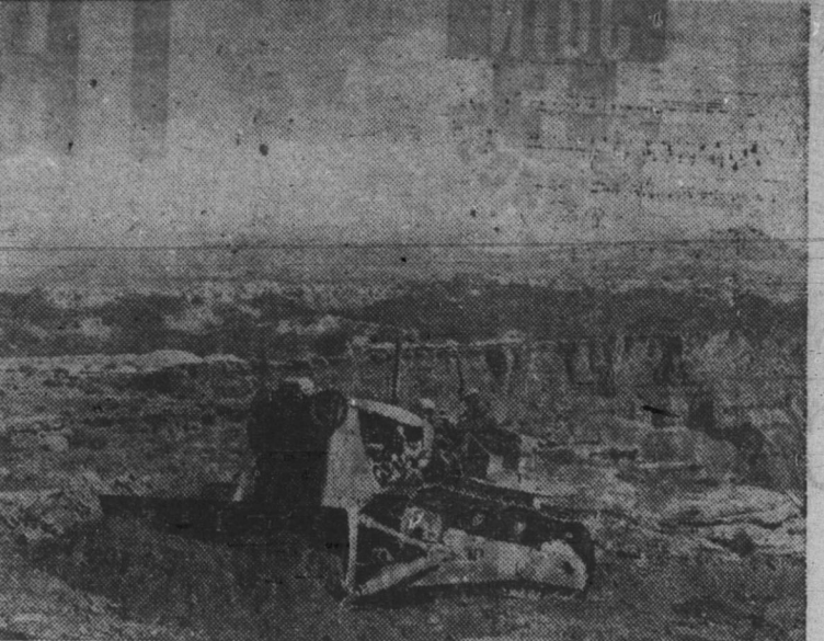
URANIUM mine near Grand Junction, Colo. uses crawler tractor (above) to build roads up side of rugged mountains to new claims.

SAPPHIRE the cat seems to be all tangled up with her pretty mistress, movie starlet Adelle August, at Hollywood, Calif.