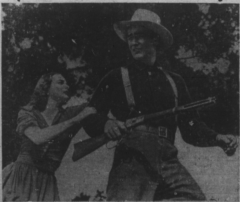
John Wayne and Betty Field in a scene from "The Shepherd of The Hills" showing at the Yancey Sunday and Monday

"DAN DAILEY STARS IN A GAY NEW 90-MINUTE MUSICAL COMEDY FOR OLDSMOBILE SAT., JAN. 21 NBC-TV"