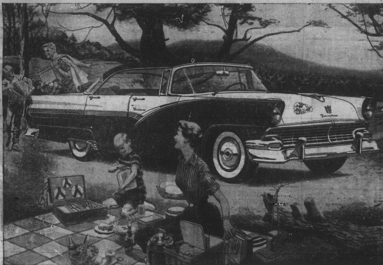
The family "chauffeurs" are going for Ford in a big way for some mighty big reasons

THE NORTHWESTERN BANK Member Federal Deposit Insurance Corporation BURNSVILLE, N. C.