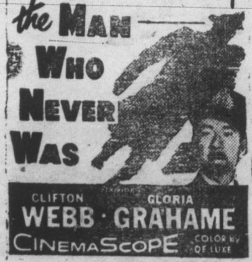
CLIFTON WEBB GLORIA GRAHAM