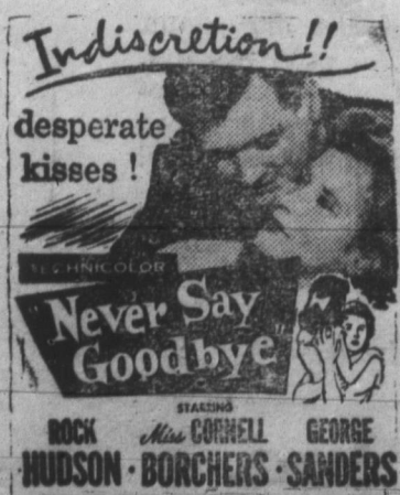
ROCK HUDSON-GEORGE SANDERS

The only way she could win back her daughter's love—was in the arms of the man who had shamed her!