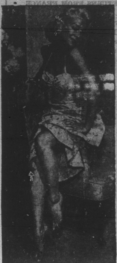
FILM EMISSARY . . . French movie actress Marlene Carol arrives in U. S. for good will tour arranged by government controlled French film industry.