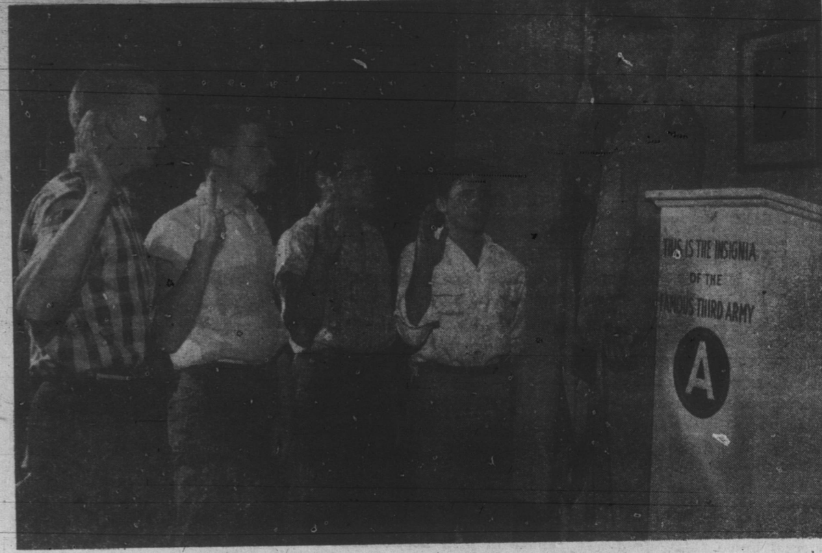
FOUR BEE LOG GARDS TRAINING AT FORT JACKSON