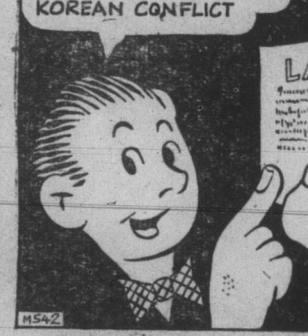
For full information contact your nearest VETERANS ADMINISTRATION office

PAY FOR THE EDUCATION OF CHILDREN BETWEEN 18 AND 23 WHOSE VETERAN-PARENTS DIED OF DISABILITIES DUE TO SERVICE IN WORLD WAR I, WORLD WART, OR THE KOREAN CONFLICT