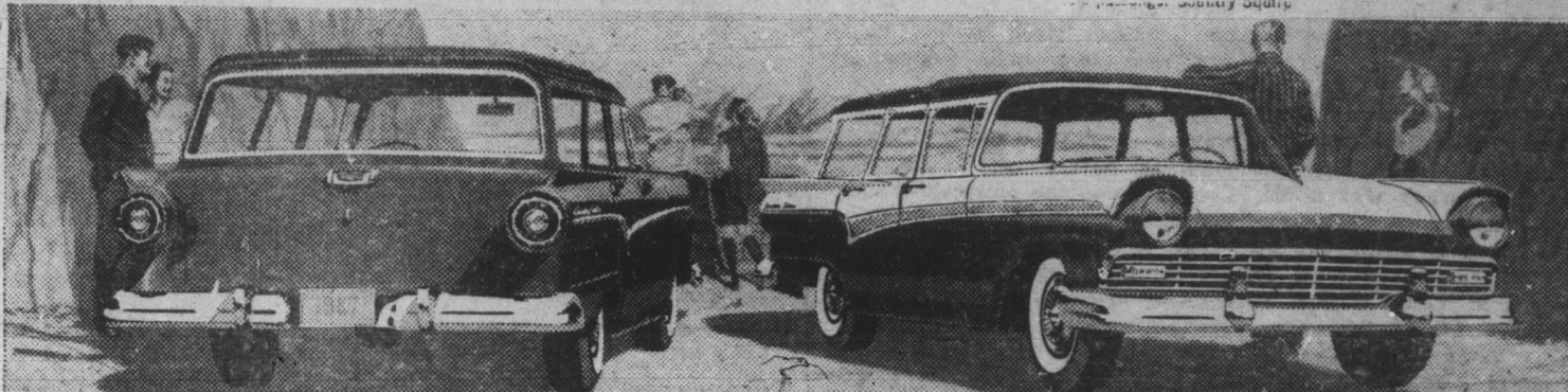
The 9-passenger Country Sedan