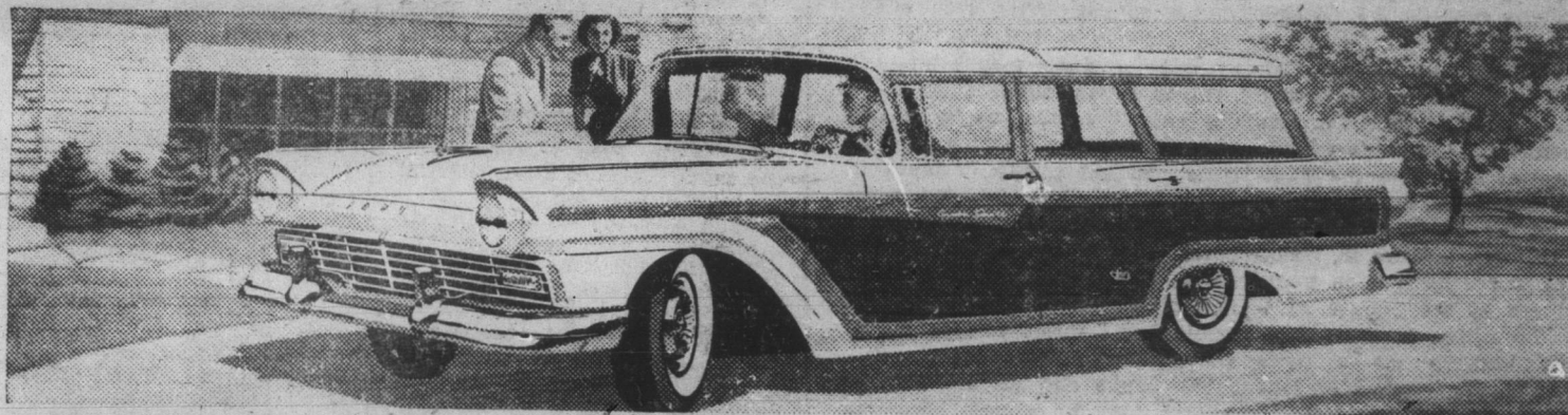
The 6-passenger Country Sedan