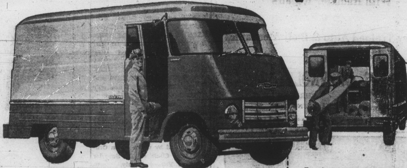
Model 3445 Step-Van with 8-foot body

For the first time Chevrolet offers forward control delivery trucks equipped with handsome, spacious walk-in bodies—the new Step-Vans! You'll find new hustle, new muscle and new style throughout Chevy's light-duty lineup for '58!