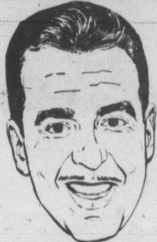
See the Ford Show on NBC-TV