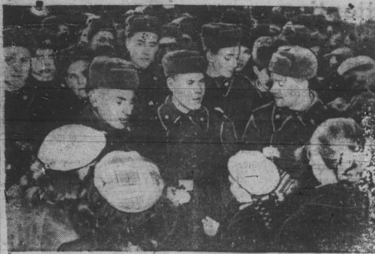
FAREWELL TO REDS . . . People of Gyor present flowers as gifts to Soviet soldiers who are being withdrawn from Hungary.

An ointment that has been used for the past two years by a prominent Mt. Holly, N. C. doctor who states "During the past thirty-seven years of general practice I have used all the well known and accepted remedies for the relief of Hemorrhoids—without a doubt the formula known as SUTHERINE gives the most satisfactory relief that I have ever used." SUTHERINE is especially recommended for the soothing relief of pain and itching in Hemorrhoid (piles). In many cases bleeding has been stopped. Ask for SUTHERINE at all drug stores.