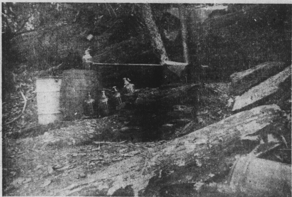
AN ILLEGAL LIQUOR STILL captured last week by Yancey County Sheriff's deputies is shown above. This is one of many stills captured and destroyed by the Sheriff's Dept. in the past few years.