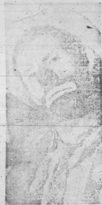
EMMETT KELLY, JR.

Support of the recommended budget requires continuing support of the people. To make certain that popular attention is directed to the continuing need, the Governor recommended that his tax program be enacted for a 2-year period and that the proposition be submitted to a vote of the people next fall to determine whether the tax level of support will be continued after July 1, 1963.