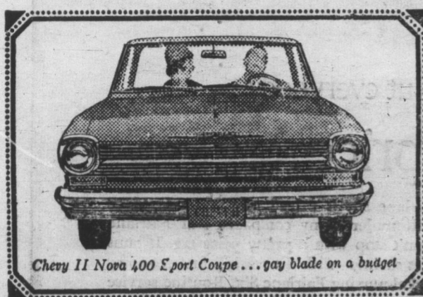
Chevy II Nova 400 Sport Coupe . . . gay blade on a budget