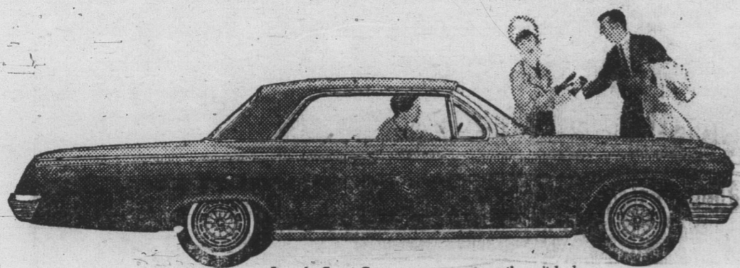
Impala Sport Coupe . . . goes as smooth as it looks

Come in and drive any (or all three) of these new cars for '62