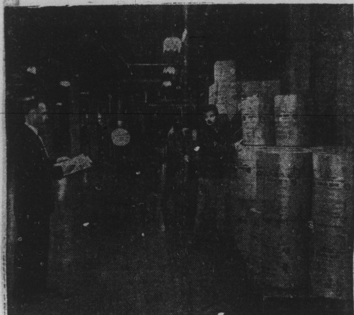
EMERGENCY SUPPLIES for the 258-person fallout shelter area in the basement of the Merchants Terminal building in Baltimore, Md., are stored as part of a 14-city test of shelter stocking procedures conducted by the Department of Defense with the cooperation of local civil defense agencies. The heavily-built basement is typical of areas in existing buildings across the nation which could make good public fallout shelters when supplied with food and water for each occupant for 14 days along with sanitation, medical and radiation detection kits. Lessons learned in the 14-city test will be applied to the stocking of community fallout shelters for up to 60 million Americans starting later this year.

Living Room Suites From $9.95 up Many odd chairs like new completely re-done, cheap. Also kitchen furniture and dining room furniture. Come in, look things over and Save Many Dollars. Yancey Used Furniture FRANK DEYTON Your Fishing Buddy