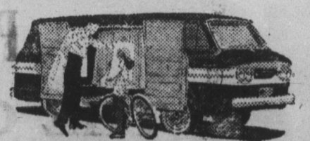
Corvair 95 Corvan. This is the strong van—the only one with double-wall construction. Has air-cooled engine in the rear, coil springs at all 4 wheels.

When you promise something will be there, a Chevrolet truck will help you keep your word almost to the point of monotony. It will do its job over and over and over again, with seldom any trouble, at very low cost. What more can you ask from a truck? Because of their reliability, people have put more Chevrolet trucks to work every year since 1937. That's a strong vote of confidence. If good service is vital to your business, make your truck a Chevrolet and make your word more dependable than ever. Call your neighborhood Chevrolet dealer soon.