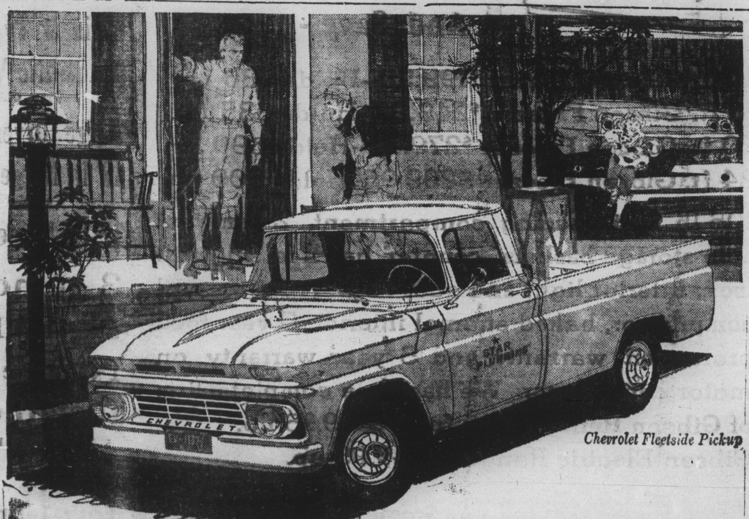
Chevrolet Fleetside Pickup

This 11 day of June, 1962. Lowe Thomas, Clerk of The Superior Court. June 14, 21, 28, July 5