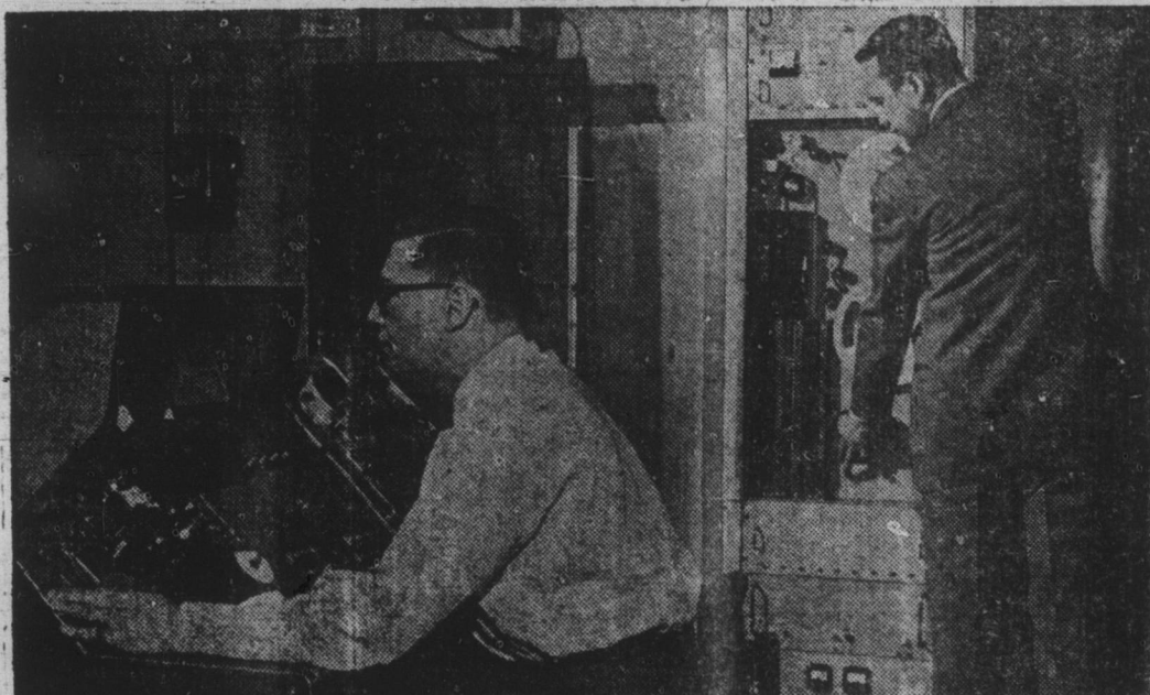
ELECTRONIC PROCESSING of information supplied by architect-engineer survey teams on potential fallout shelters assures that this data will be compiled and supplied more quickly to civil defense officials. Using Federally furnished shelter supplies, CD authorities will mark and stock shelter areas located and reported in the survey. Technicians are shown transferring microfilmed survey data to magnetic tape in the U.S. Census Bureau headquarters at Suitland, Md., so the information can be run through computers.