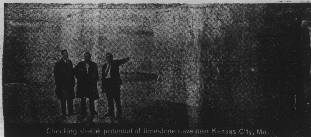
Checking shelter potential of limestone cave near Kansas City, Mo.

SHELTER PROGRESS RAPID The national civil defense program of surveying fallout shelters for up to 60 million Americans is ahead of schedule, and should be completed before the end of 1962, according to officials of the Defense Department's Office of Civil Defense. By October 1 OCD expects to have in the hands of local civil defense authorities complete information on the number and location of shelter spaces available in each community. From information obtained by the Federally-financed National Shelter Survey, local civil defense officials will know also how many persons in each community could be sheltered, how many could not be sheltered under present conditions, what additional space could be modified into shelter areas, how much it would cost, and similar data. Local architects and engineers surveyed shelter areas under contract to the Army Corps of Engineers or the Navy Bureau of Yards and Docks. Under present plans, civil defense authorities receiving this information would then be responsible for marking shelter areas with a nationally-standardized sign. They would stock shelter areas with specially-prepared 14-day supplies of food, water, sanitation and medical items, and fallout detection instruments—all provided by OCD. The shelter survey, marking, and stocking program, announced last August and put in operation Dec. 1, 1961, is the first part of a broader plan to provide fallout shelters for virtually all Americans over the next five years.