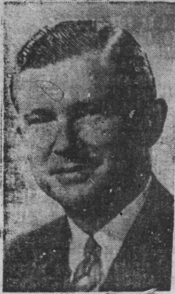
JOHN G. TOWER

ASHEVILLE — U. S. Senator John G. Tower of Texas, Republican who replaced Vice-President Lyndon Johnson in the Senate, will speak at a Citizens for Brown Breakfast in Asheville's Municipal Auditorium at 8:15 A. M. Thursday, October 25.