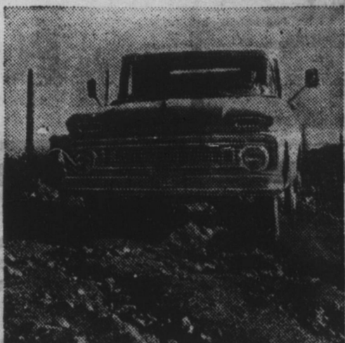
Conventional light-duty units have coil-spring independent front suspension — easier on truck, load and driver.