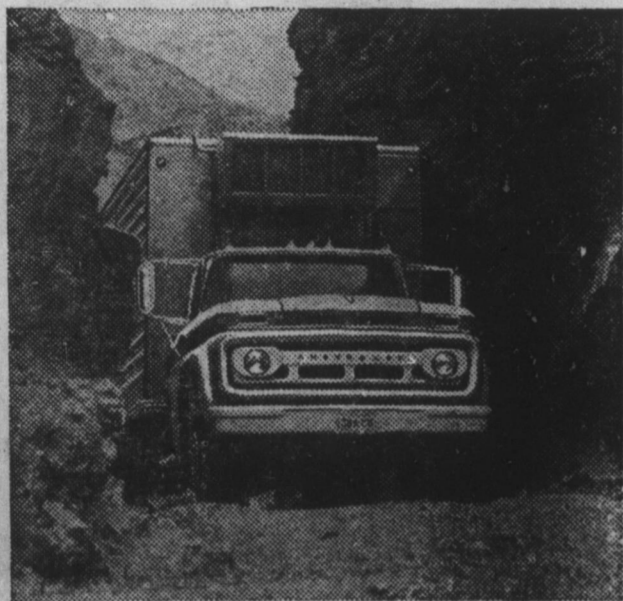
Users of new conventional medium- and heavy-duty units who have to operate in close quarters are going to like the narrower front ends (up to 7 inches).