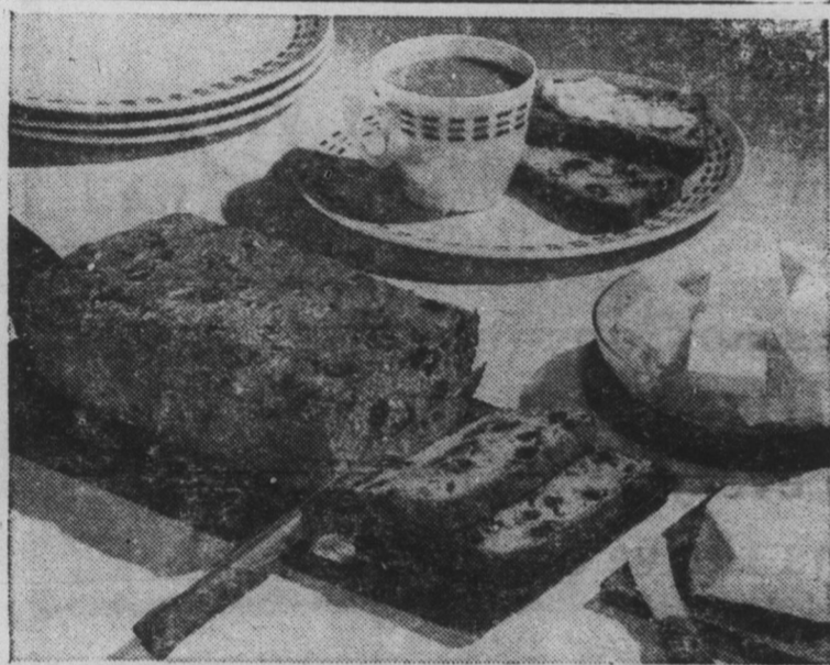
Cranberries, raisins and pecans team up with cottage cheese to make this moist, flavorful loaf and a perfect choice for snack-time.