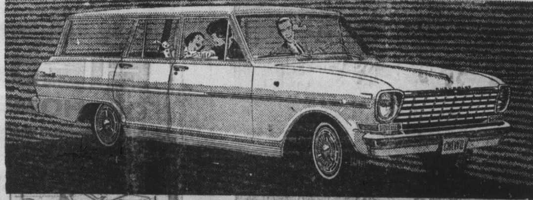
'63 CHEVY II NOVA 400 STATION WAGON—Gives modest budgets lots to brag about.