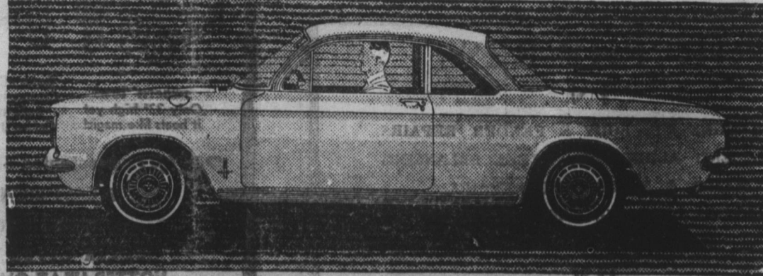
'63 CORVAIR MONZA CLUB COUPE—Lets your whole family get into the sports-car act.

Ask about "Go with the Greats," a special record album of top artists and hits and see four entirely different kinds of cars at your Chevrolet dealer's—'63 Chevrolet, Chevy II, Corvaair and Corvette