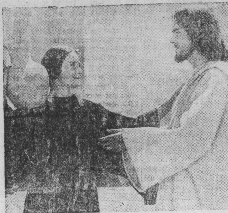
Jeffrey Hunter, in his portrayal of Jesus, with Siobhan McKenna as Mary, in Metro-Goldwyn-Mayer's presentation of "King of Kings," unfolding a story of the life and times of Christ. The spectacular Samuel Bronston production, filmed in Techniscope Super Technirama Technicolor with a cast of thousands, was directed by Nicholas Ray.

Coming Soon to Yancey Theatre Adm. Adults $1.00 Children 50c