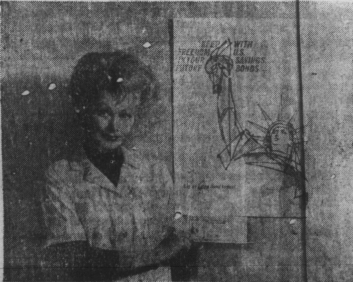
"For Christmas give the Present with a Future—a U. S. Savings Bond," says Lucille Ball, star of the new CBS series, "The Lucy Show." "Here's a truly precious gift—one that not only grows more valuable in the future, but one that also helps preserve freedom." Take Lucy's tip and give the perfect gift for everyone on your Christmas list—U. S. Savings Bonds, Shares in America.