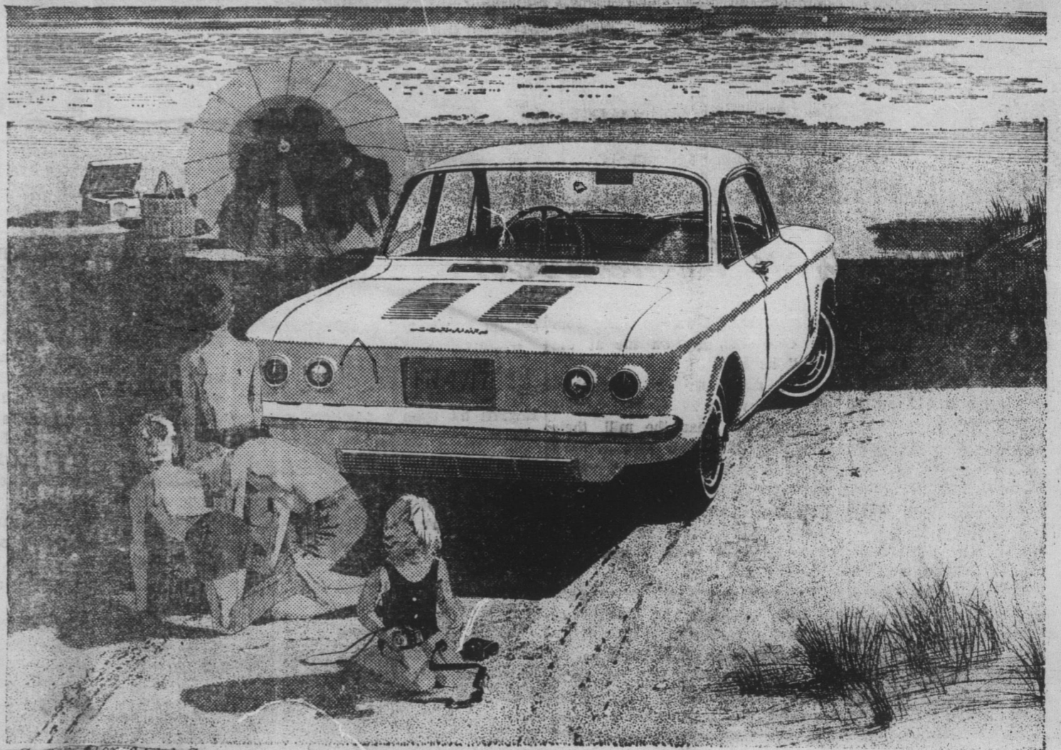
Corvair Motor and Coupe