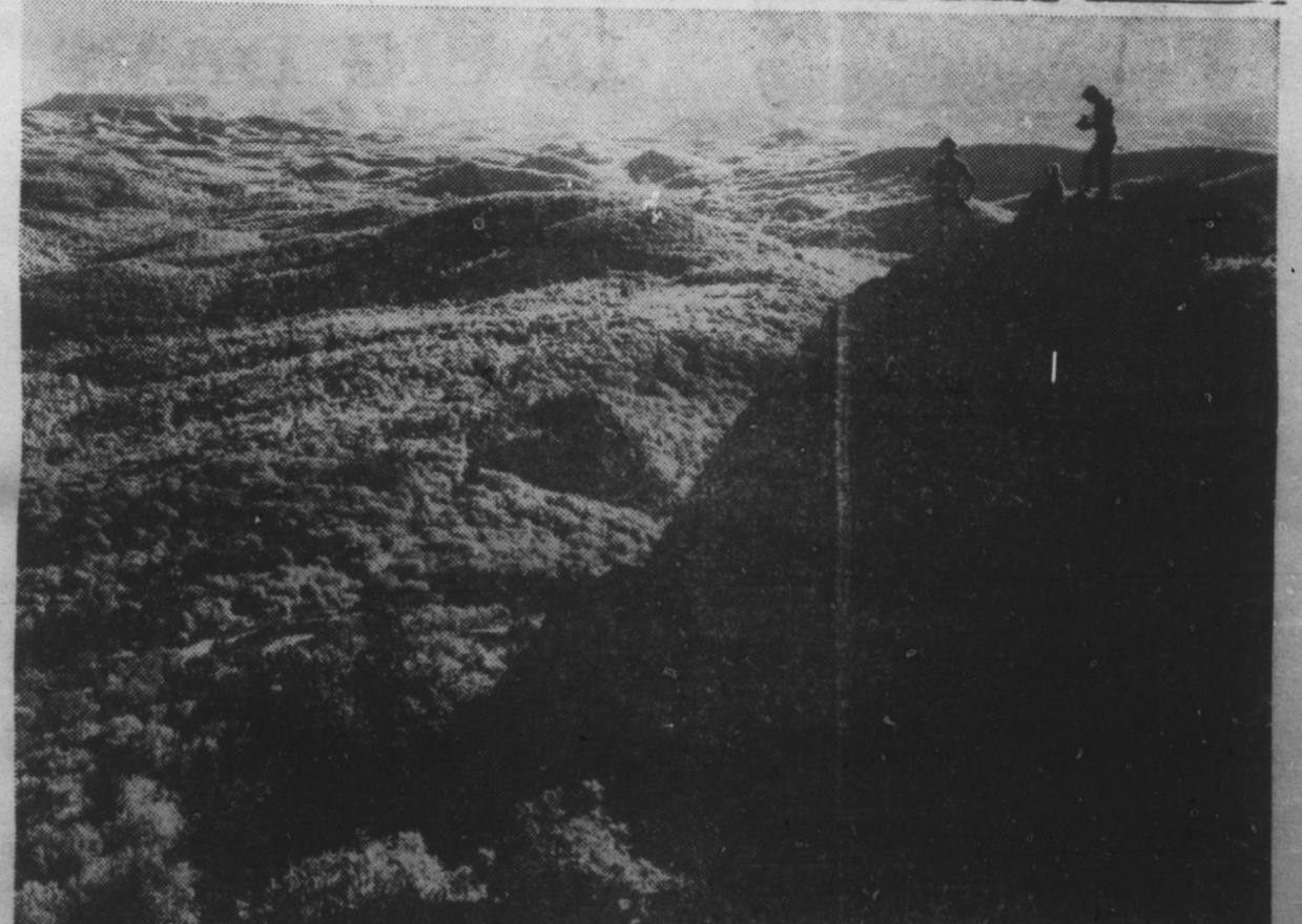
FALL COLOR IN THE MOUNTAINS — Once again Nature's paint brush has turned the leaves into brilliant reds and golds in the Great Smoky and Blue Ridge mountains. From such vistas as here atop Grandfather Mountain, North Carolina, autumn color can be seen for miles across the valleys and foothills.