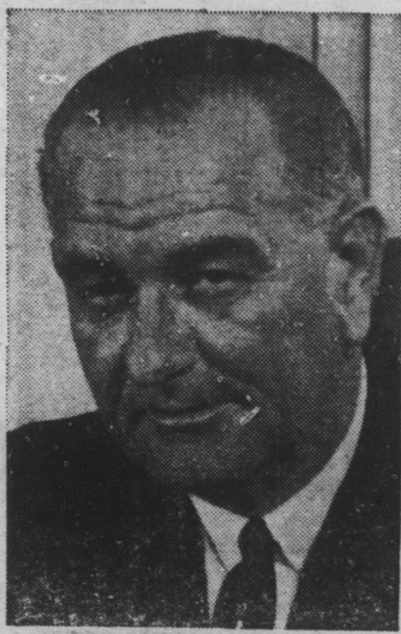
LYNDON B. JOHNSON