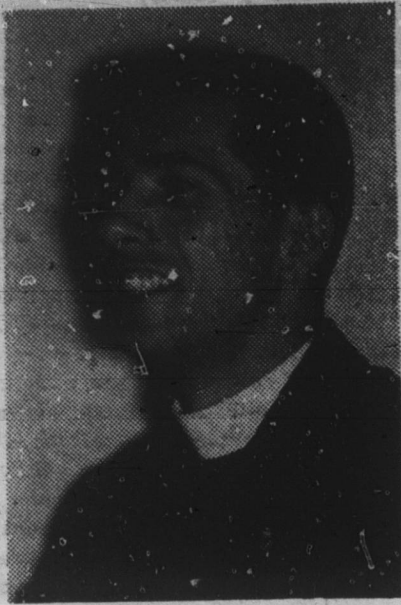
COURTESY - A FORGOTTEN VIRTUE