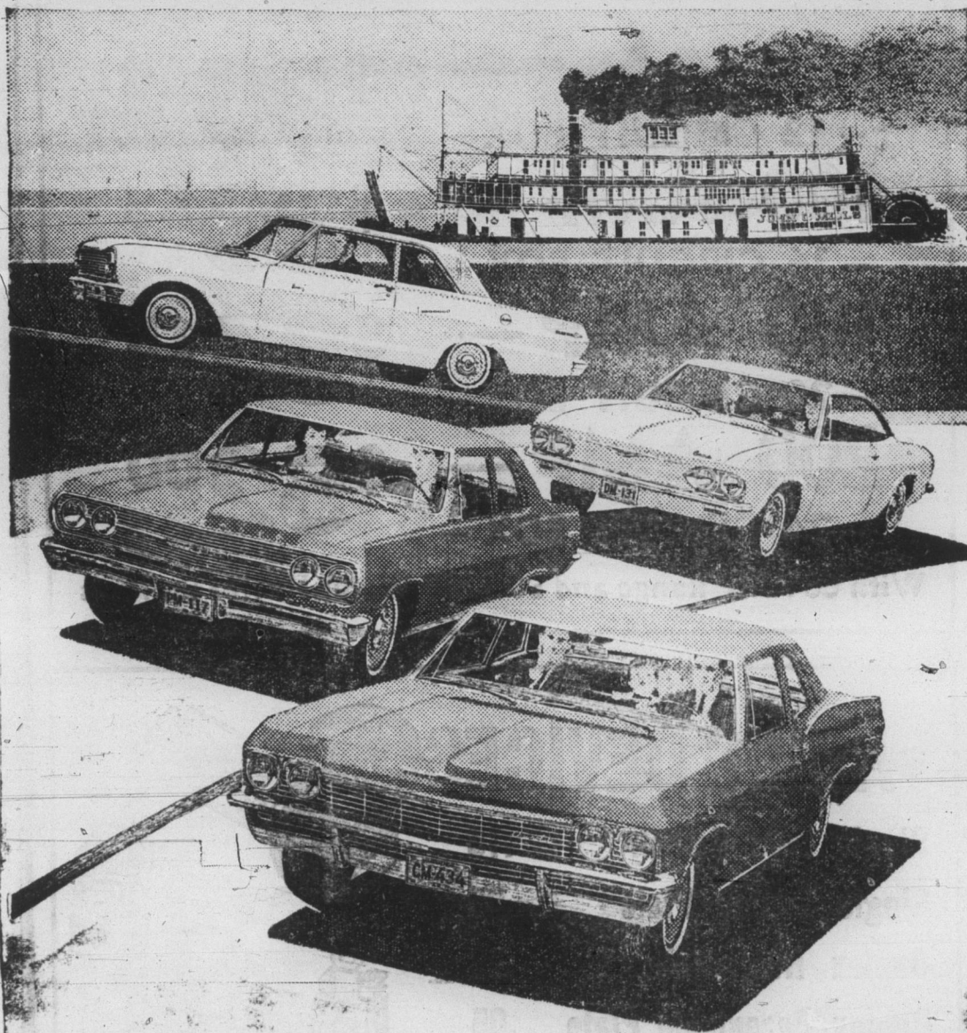
Top to bottom: Chevy II 100, Corvair 500, Chevelle 300, Chevrolet Biscayne. All 2-door models.

'65 CHEVROLET These great performers are the lowest priced models at our One-Stop Shopping Center