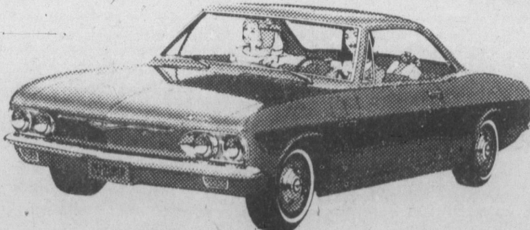
CORVAIR 500 SPORT COUPE