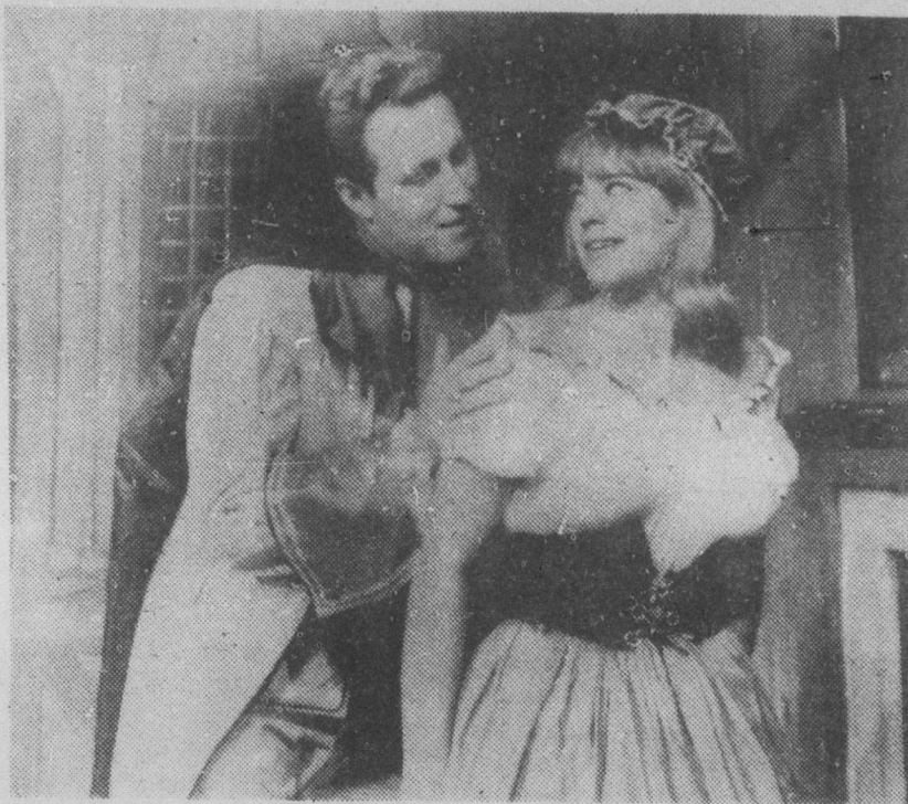
A Scene from "Lady Bountiful", original musical at the Parkway Playhouse.