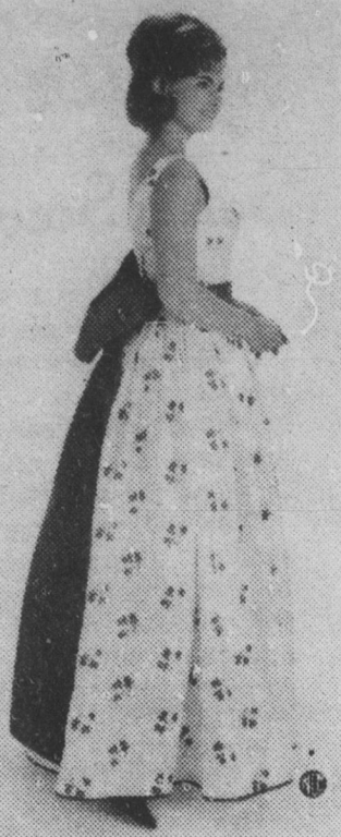
FEMININE —Everglaze cotton satin, sprinkled with floral embroidery, makes a gown fit for queenly Vonda Kay Van Dyke, Miss America 1965. Emphasizing her tiny waist is a bright red sash, tied and bowed for back interest.

God has two kinds of gifts. Some of his gifts will come whether we ask for them or not. Light, air, food, etc. "His rain falls on the just and equally on the unjust." (Mt. 5, 45). But other gifts are conditioned upon our request. We pray in petition not to tell God of our needs . . . He already knows them, but rather to give Him the opportunity to give us the gifts He will give only when we are spiritually ready to accept them. The light of the sun is there, but we can close our eyes to it. The air is all about us, but we can close our lungs to it and suffocate. God's goodness is there but we can close our hearts to it.