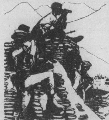
A security outpost overlooking the Chu Lai airstrip is manned by Marines formerly of the 1st Marine Brigade, Hawaii.

This year for the first time committees are working in all of the 100 counties. Get in touch with your county extension chairman or your high school principal for additional information and group travel plans.